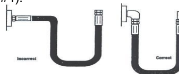
FIGURE 2 — ELBOWS AND ADAPTERS