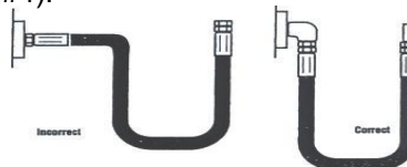
FIGURE 2 — ELBOWS AND ADAPTERS